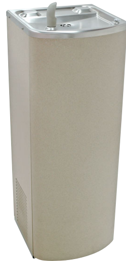
Model A611104F Shown