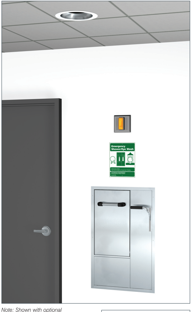
AP280-230 electric light and alarm horn unit (sold separately).