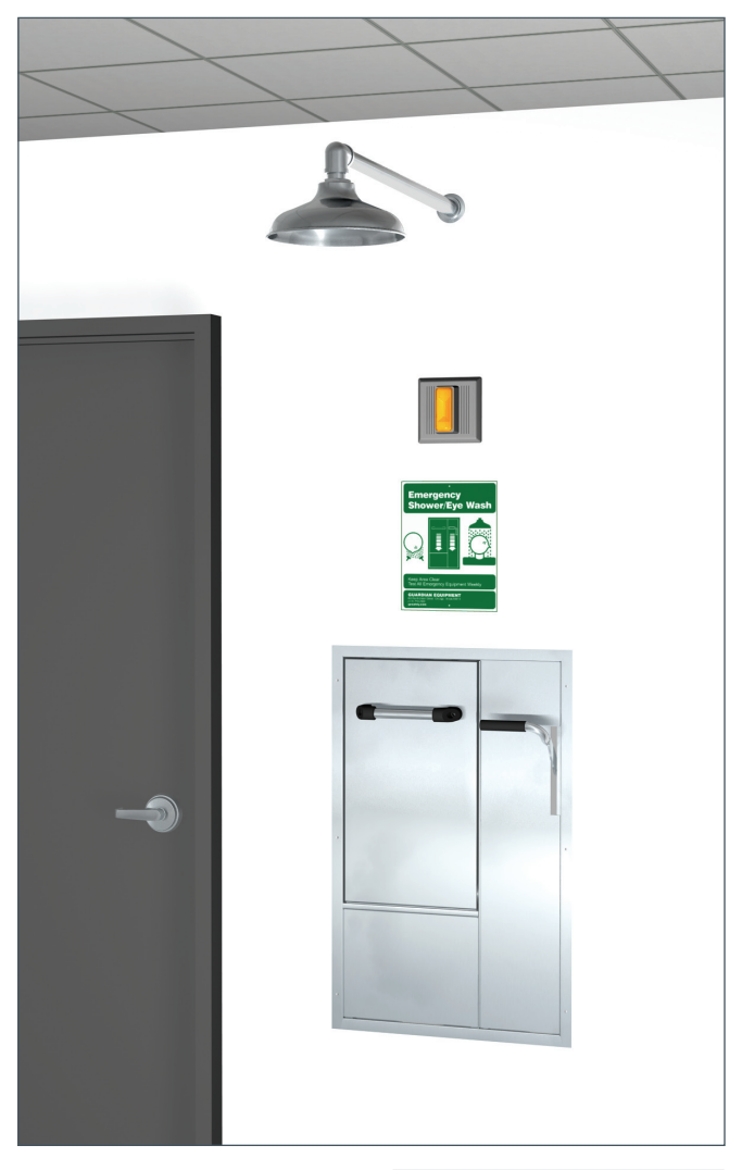
Note: Shown with optional AP280-230 electric light and alarm horn unit (sold separately).