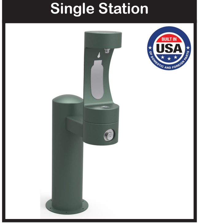
Model LK4410BF is shown.