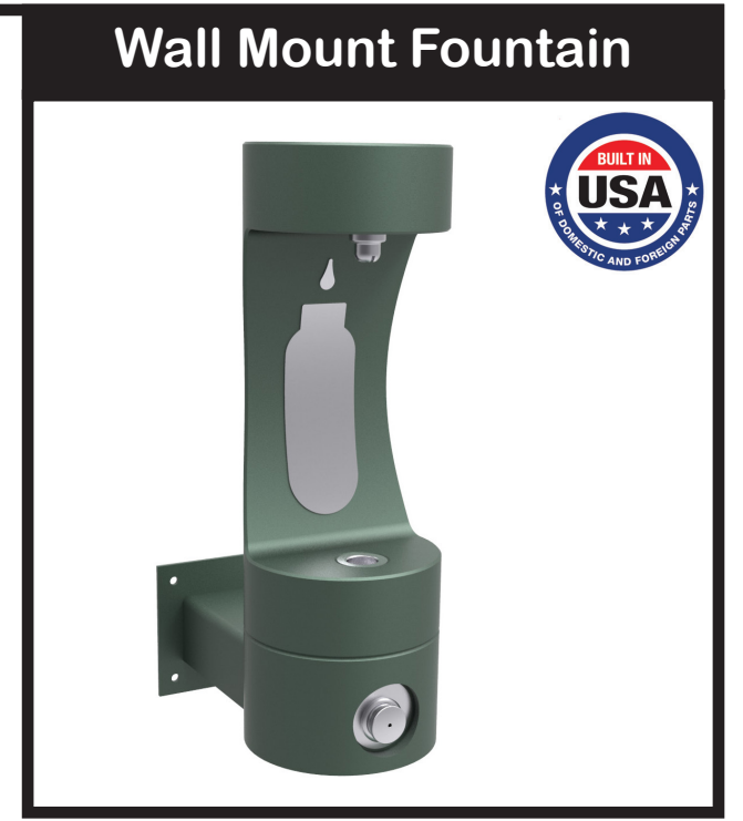
Model LK4405BF is shown.